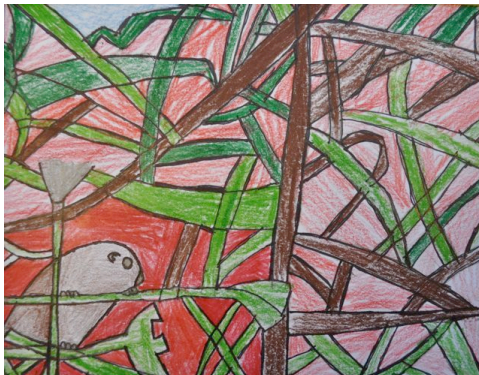
Each of these drawings has a sense of unity and completeness using the