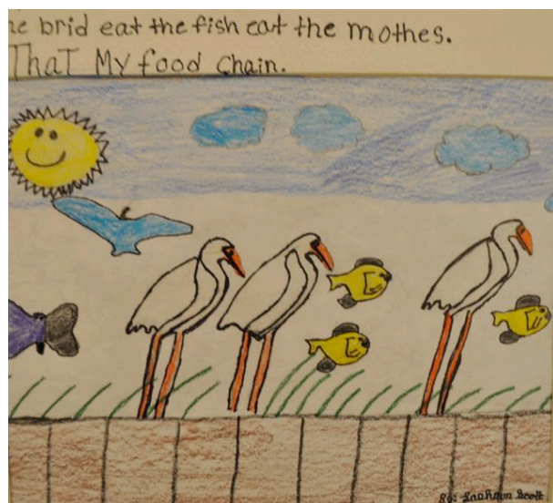
Can you identify ways the students used the art elements to make an effective design?